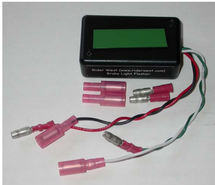
Figure 1. Brake light flasher for center brake light

The brake light flasher connects to the center brake light on the K1200LT trunk rack. It makes the brake light flash rapidly for about two seconds, and then it stays on solid for as long as the brake is applied. The cycle repeats every time the brake is applied.