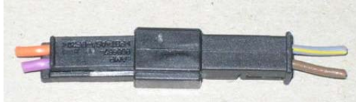
Figure 3. Check wire colors in connector