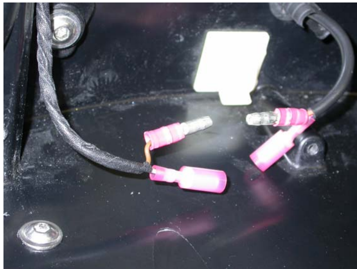
Figure 4. Bullet connectors installed