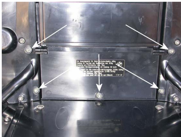
Figure 2. Remove 5 screws to remove plastic cover